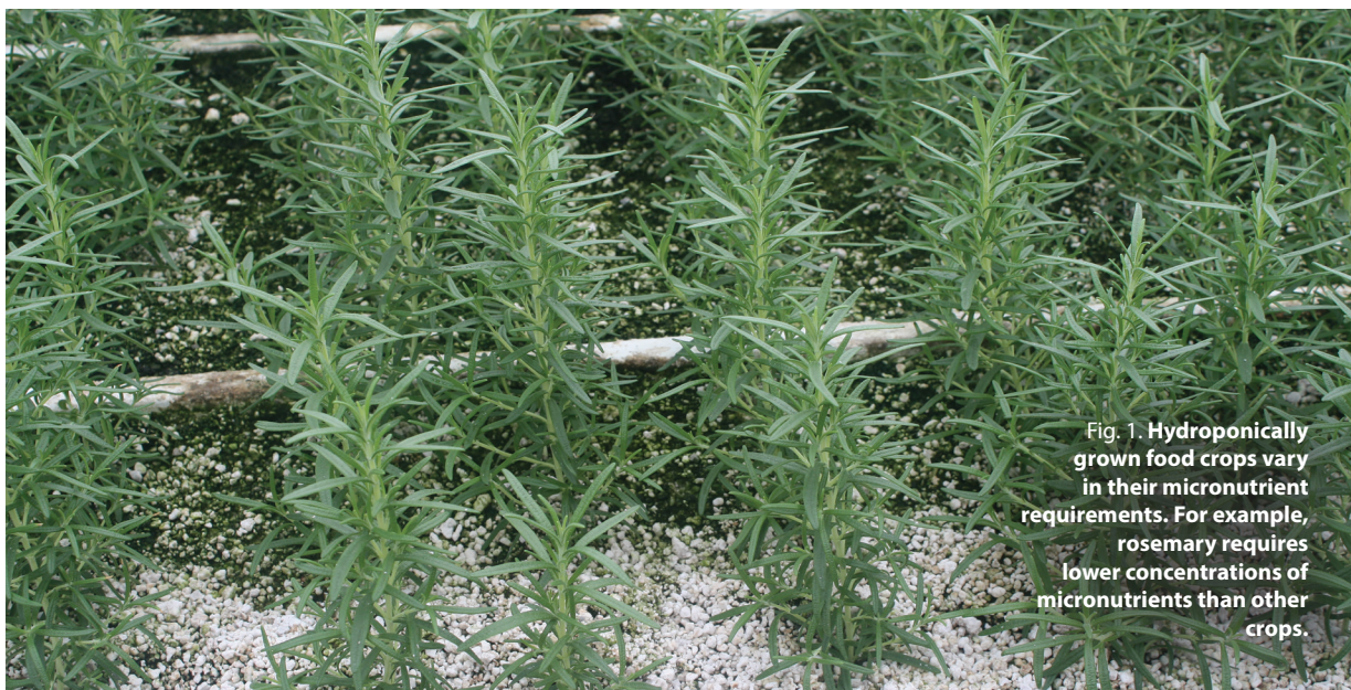
Fig. 1. Hydroponically grown food crops vary in their micronutrient requirements. For example, rosemary requires lower concentrations of micronutrients than other crops.

For food crops grown hydroponically, the variety in micronutrient requirements is going to be the same as substrate-based systems, with some species requiring higher or lower amounts of micronutrients than the average crop. For example, basil is a crop that generally requires