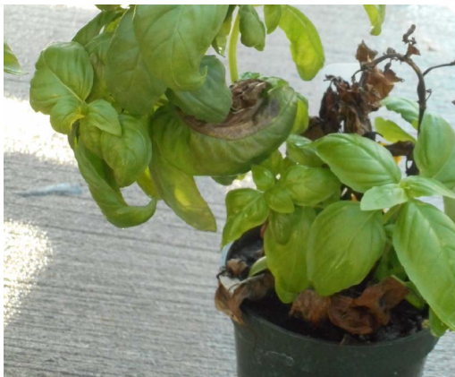
Figure 3. Stems can become distorted and exhibit a characteristic "shepherd's crook" as seen in the dead stem in this picture.

There are no fungicides registered for control of Fusarium wilt on greenhouse- grown basil. Therefore cultural controls such as trying to avoid infected seeds, treating seeds with hot water and crop rotation in the field are the primary treatment methods. Hot water disinfection is impractical, however, because basil seeds become sticky after treatment. Only purchase basil seed that has been tested and found free from the Fusarium wilt pathogen. These tests grow out a large number of seed from each lot and look for disease symptoms. While testing does not guarantee absence of disease, it reduces the risk. Three “Genovese-type” sweet basils are resistant to Fusarium wilt: ‘Nufar’, ‘Aroma 1’, and ‘Aroma 2’. While these cultivars are resistant to Fusarium wilt, they are susceptible to basil downy mildew, another devastating basil disease. High ammonium-nitrogen fertility appears to promote development of the disease while nitrate-nitrogen may reduce its development. Good greenhouse cultural and sanitation practices should be followed. Always remove infected plants immediately—sporulation on the surface of the dead stem areas can otherwise be splashed to nearby pots or even become airborne. Disinfect greenhouse benches and hydroponic equipment between crops or immediately after an outbreak occurs.