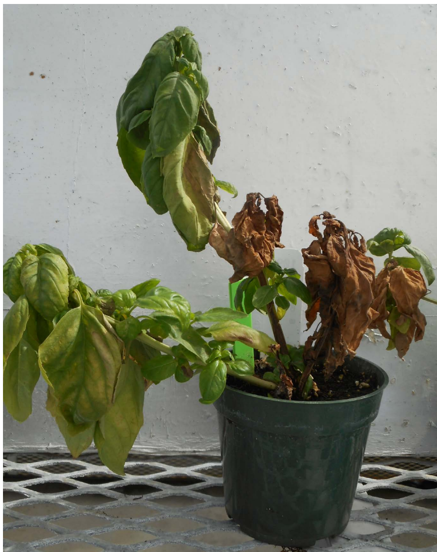
Figure 5. Fusarium wilt infection of three basil plants in the same container. Notice plants on right were infected first and eventually the disease progressed to plant on the left.