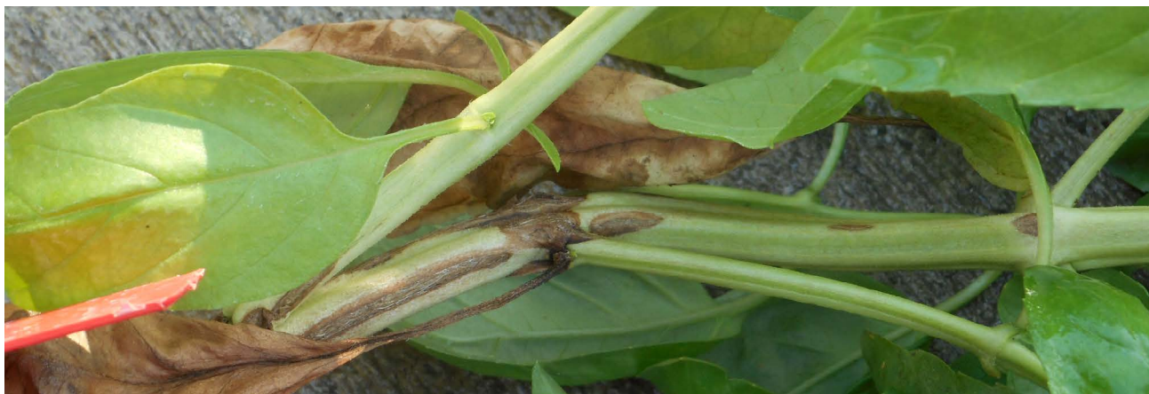
Figure 4. Stem lesions on basil infected with fusarium wilt.