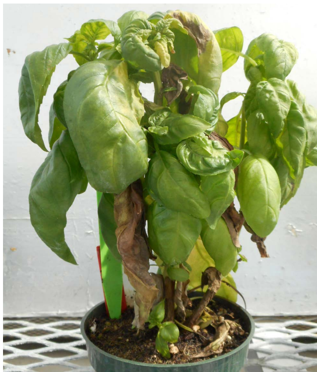
Figure 1. Basil with fusarium wilt. Notice wilted, yellow leaves and distorted new growth.

Early symptoms of Fusarium wilt, as its name implies, are plants that suddenly wilt, appear stunted, or show yellow leaves (Figure 1). These changes in appearance are due to infection of the xylem vessels, which can become plugged and restrict water movement. The xylem vessels will appear discolored. Eventually, brown lesions on the stem may be apparent (Figure 2). Severely twisted stems leading to a “shepherds crook” (Figure 3) and leaf drop can occur. Young seedlings typically do not exhibit symptoms: rather, symptoms