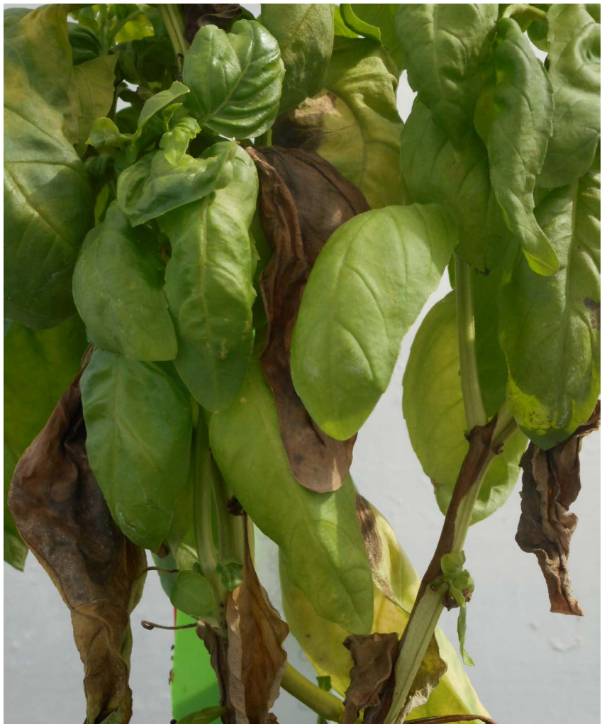
Figure 2. Symptoms of basil fusarium wilt including stem-lesions (often one-sided initially), wilting and leaf yellowing. As symptoms progress, older leaves may fall off plant.

Fusarium wilt in basil was first reported in the U.S. in the early 90s. The disease is primarily introduced to field, greenhouse, and hydroponic production settings from infected seed. Fusarium wilt has become a devastating disease in sweet basils, cropping up from time to time with infected seed lots as well as spreading within the greenhouse from handling or splashing irrigation water onto infected plants. Fusarium can overwinter in the field and survive for many years. Sweet basils are more sensitive to Fusarium than other varieties.