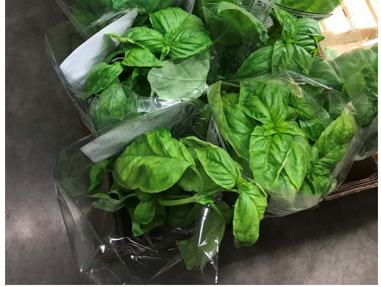
Figure 6. Chilling injury of potted basil in a grocery store produce department with an air temperature set point of 50 °F.

afternoon or early evening and then store chilling-sensitive leafy crops for 1 day at 50 °F before refrigerated shipment at 41 °F. It has also been reported that increased resistance to chilling injury of afternoon-harvested basil can be correlated to a 10-fold accumulation of carbohydrates such as starch.