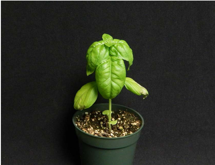
Figure 5. Young potted basil after exposure to 3 days of 43 °F in a cooler, followed by 3 days at 72 °F. Notice yellowing and brown discoloration of bottom leaves.