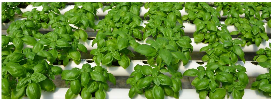
Figure 1. Hydroponic nutrient film technique (NFT) greenhouse basil production.

Demand for year-round and locally produced fresh-cut and potted culinary herbs such as basil ( Ocimum basilicum L.) has been increasing rapidly in recent years. Greenhouse growers and indoor vertical farms are benefiting from this demand (Figure 1) by expanding production and products (Figure 2). However, a major challenge for producers, distributors, packers, and exporters of fresh-cut and potted basil, shiso or beefsteak plant ( Perilla frutescens var. crispa ), and some oregano ( Origanum ) species is chilling injury especially during winter months. Most other commonly used fresh-cut herbs marketed in clam shells can be stored at temperatures between 32 to 36 °F (0 to 2 °C) without injury. Since basil is native to tropical regions, is it susceptible to chilling injury at temperatures below 54 °F (12 °C) during transport, distribution, storage, and marketing in the retail environment. Therefore, 54 °F is generally the recommended temperature for storage and shipment of most basil cultivars.