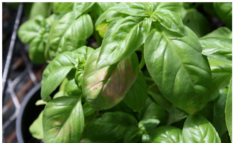
Figure 4. Chilling injury symptoms of potted basil in a garden center.