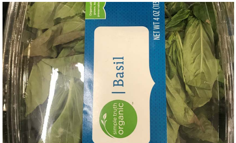
Figure 3. Characteristic chilling injury symptom of brown discolorations (top left) on cut basil in a plastic clam shell. The clam shells were not in the display cooler with the other cut herbs.