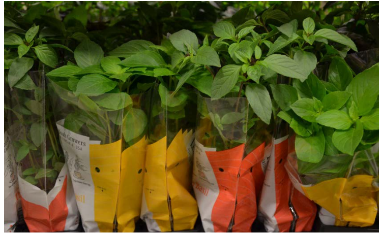
Figure 2. Typical packaging of potted greenhouse or vertical farm produced herbs. Potted herbs are then marketed in grocery store produce departments.

A review of the literature indicates that researchers around the world have explored a wide variety of treatments and technique to prevent or reduce chilling injury of basil with success. Recent research has shown that the time of day that ornamental cuttings such as euphorbia and lantana are harvested influences their post-harvest life. Aharoni et al (2010) reported that harvesting sweet basil at 8 AM (2 hours after sunrise) resulted in severe leaf browning, decay, and abscission after 5 days at 54 °F plus 2 days at 63 °F (17 °C). However, harvesting basil at 4 PM resulted in reduced browning, decay, and abscission after exposure to the above chilling temperatures. Previous work conducted at Michigan State University by Lange and Cameron (1994 and 1997) indicates that shelf life of sweet basil stored at temperatures at or above 50 °F (10 °C) improved when harvested during the afternoon. They conclude that a possible solution to large losses caused by chilling injury might be to harvest in the late